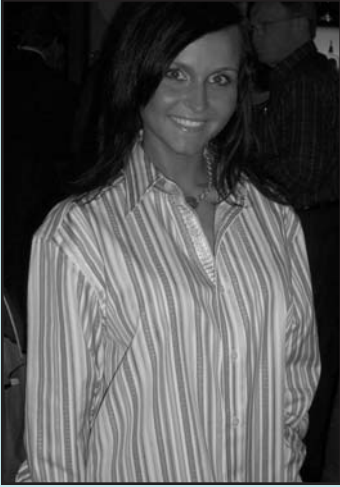
ZEN shirt model.

E arlier this year, FCC held a fundraiser at local hot eatery, Wapango . FCC received a percentage from all reservations called in and honored that day on FCC's behalf. Thanks to everyone who came out to support us!